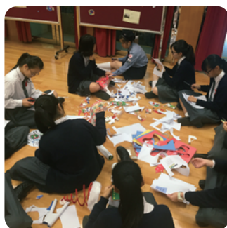
Students preparing for the mathematics activity

With three months' preparation, three days' setting time and more than ten people's efforts, our school held a mathematics activity with Shau Kei Wan East Government Secondary School (SKWEGSS) on 3 December, 2015. Form two students of SKWEGSS came to our school and joined the activity with our students.