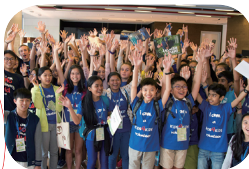
Students at the Powered By Youth Forum 2015