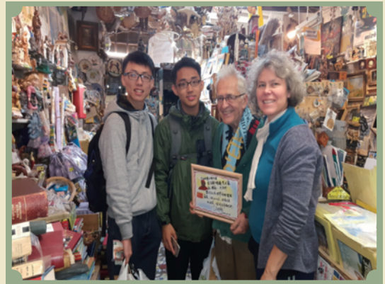
Visiting an old artist and owner of an antique card shop