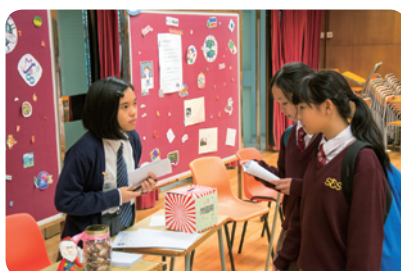
Students participating in games