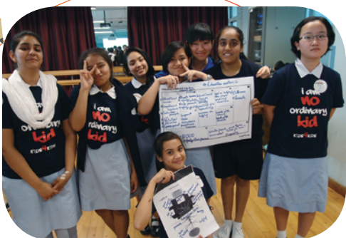
Participants of the Powered By Service Workshop shared their Tree Diagram and Project Canvas

On 12 September and 10 October 2015, 15 S2 and S3 students were invited to join the 'Powered by Youth Forum (PBY) 2015' together with over 100 students from both local and international schools. Students with different backgrounds across Hong Kong joined the forum which introduced several main themes not commonly found in the traditional school curriculum. PBY was delivered in partnership with 'Usher's New Look', a U.S. based non-profit organisation focusing on developing global youth leaders by providing access, awareness and empowerment. Adopting a peer-to-peer training model, PBY focused on developing well-rounded, forward-looking