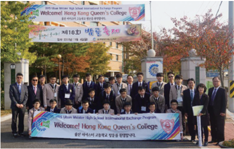
Ulsan Meister High School