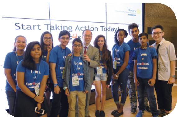
Committee members of Kids4Kids Club

leaders who excelled in being change-makers, taking action and supporting the community.