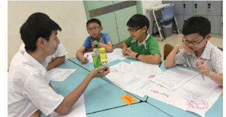
The TMGSS volunteer guided the primary pupils to develop their arguments

Our students, with the support of their English teachers, worked tirelessly in this programme.