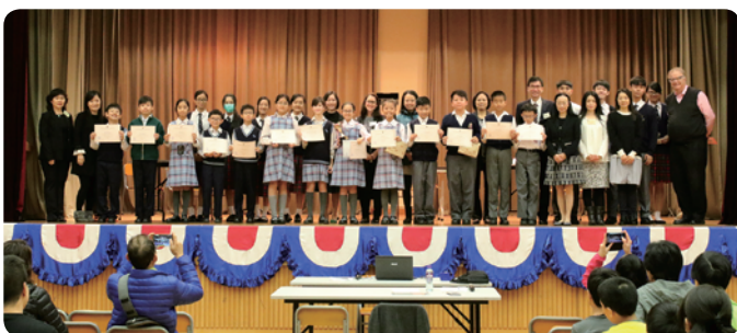
The Primary School Debating Teams, TMGSS volunteers and teachers

The second programme that provided an opportunity for students to use English authentically through serving