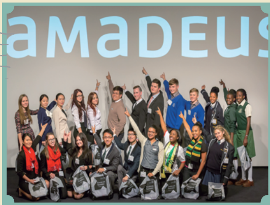
Participants at the GTP Student - Teacher Conference