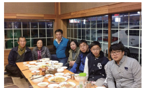
Students having meal with their Korean Buddies

At weekends, the host families brought our students to various interesting places for different activities. They went to an aquarium,