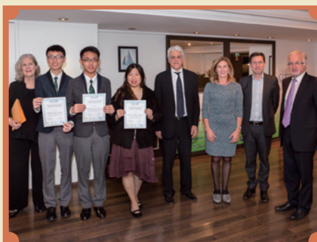
Certificate presentation at the Awards Dinner